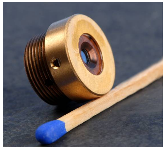
Fig. 2: OPSDL semiconductor structure with transparent heatspreader, mounted inside a submount. This mounted chip is the core for all different laser resonators.

For further information please do not hesitate to contact us: